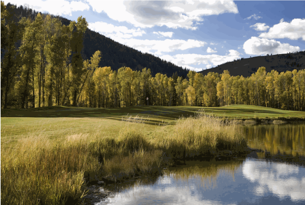
Snake River's eleventh hole

A new ownership group is poised to reopen the Snake River Sporting Club, and its Tom Weiskopf-designed golf course, in Jackson Hole, Wyoming.